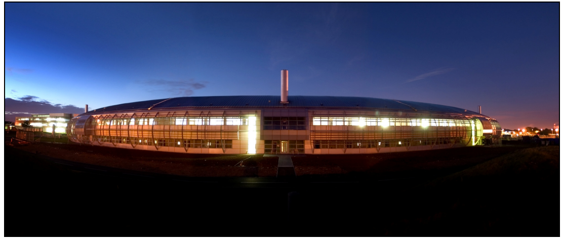
Diamond at dusk.

76. These campuses are thriving environments for businesses, industry and universities in biomedical and life sciences research, energy, security, food and agriscience, climate and the environment. They offer access to advanced facilities and scientific services, a culture of collaboration and innovation to support the creation and growth of new businesses, and access to a unique training environment and world-leading expertise. And they are magnets for significant inward investment. For example, Element Six (formerly De Beers Industrial Diamond), are the world leader in synthetic diamonds, and are investing £20m at the Harwell Oxford campus to construct the world's largest and most sophisticated synthetic diamond supermaterials research centre<sup>28</sup>.