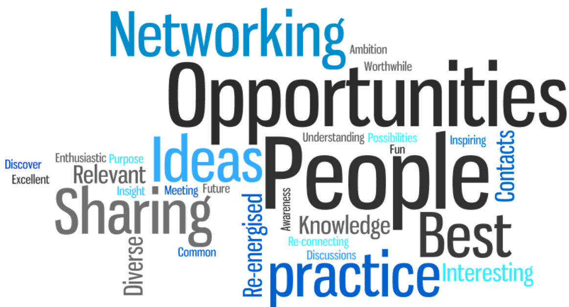
Figure 1: Delegate responses to 'Overall, what do you feel you have gained or learned most from today?' (n=33)

When asked to comment on what they felt they had gained or learned most from the day, the overall impression seems to be that delegates had gained new ideas and opportunities. Many delegates also noted the networking opportunities, saying they had met lots of people and gained new contacts.