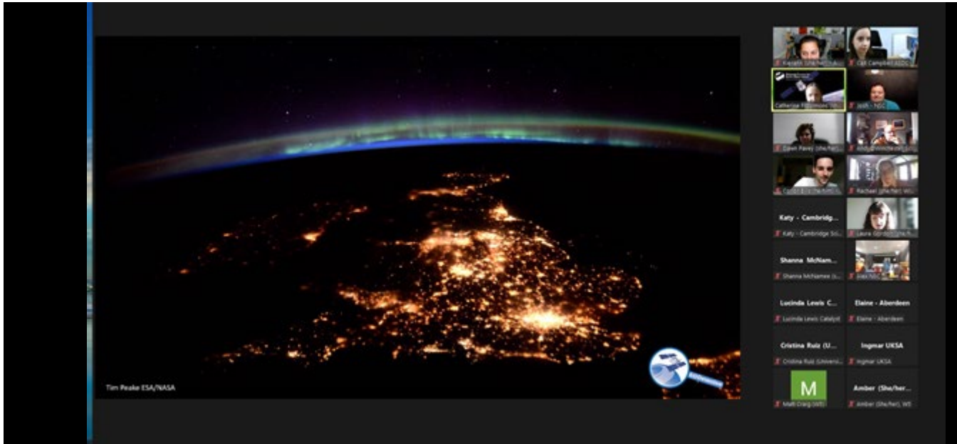
Destination Space training academy