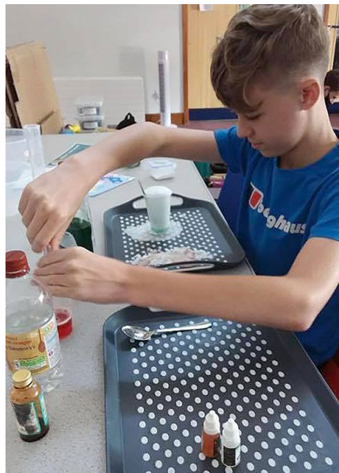
Photo from left to right: community partnership case study as part of Explore Your Universe project; child enjoying an exhibit at Techniquest; science communicator doing an experiment with a child at Winchester Science Centre & Planetarium.

We're excited to be working with our current members and new members over the next year, with lots of inspiring projects and new opportunities on the horizon. Together, our vision is for a society where science is accessible, inclusive, and valued by all as a fundamental part of everyday life.