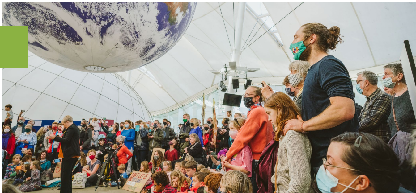
Soundhouse choir perform to an audience beneath Gaia as part of Dynamic Earth's Climate Science Showcase for Operation Earth