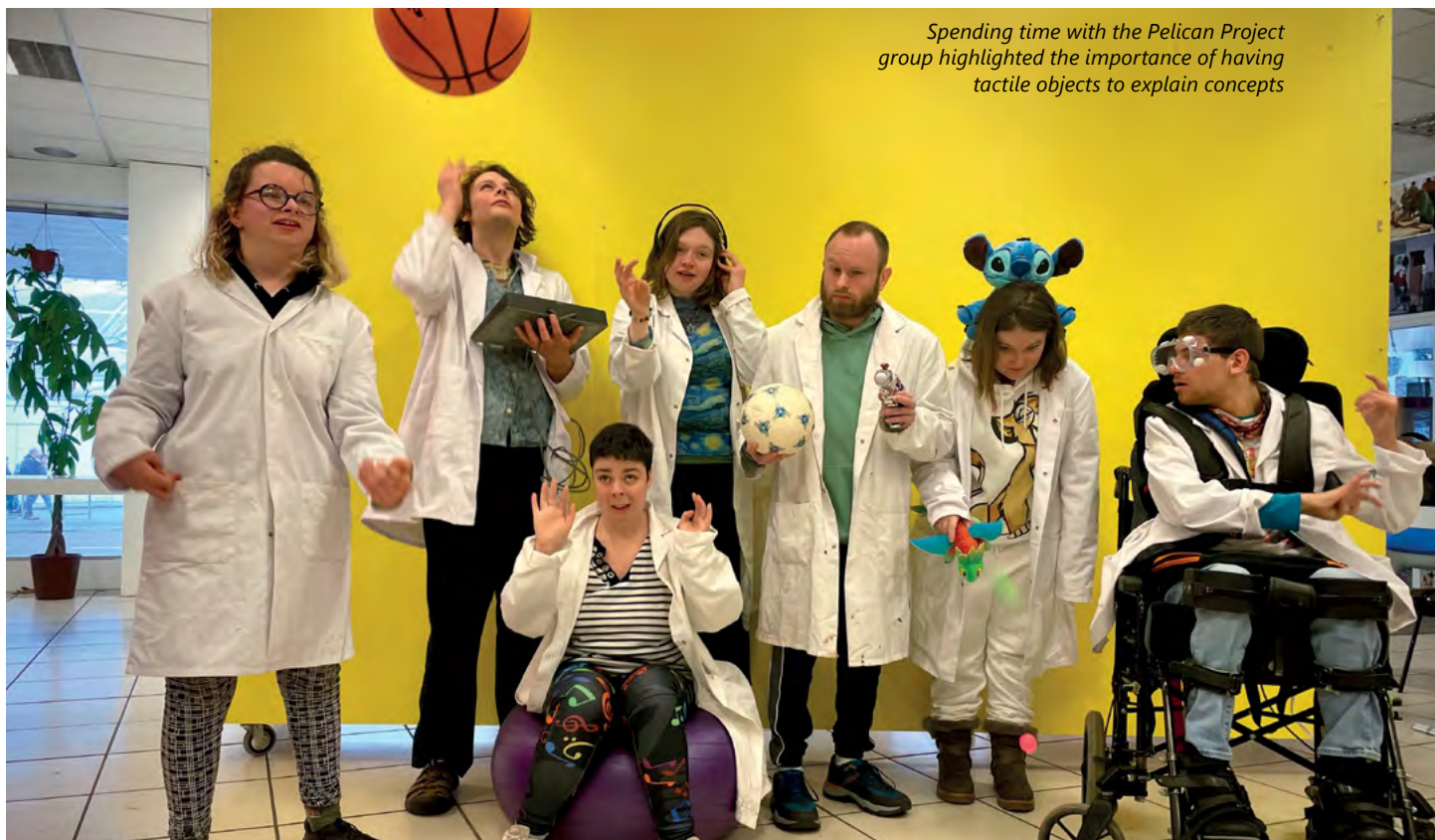
Spending time with the Pelican Project group highlighted the importance of having tactile objects to explain concepts