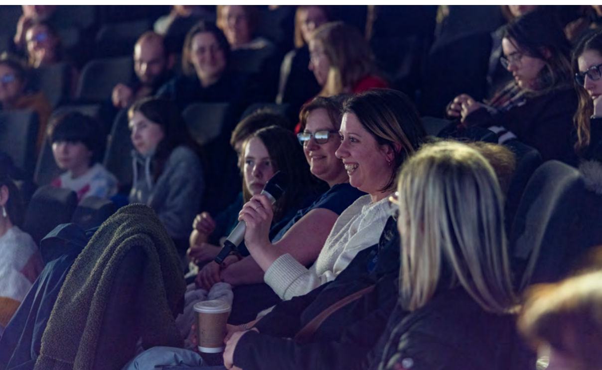
The evening focused on inspiration and aspiration, encouraging and supporting women to pursue STEM careers