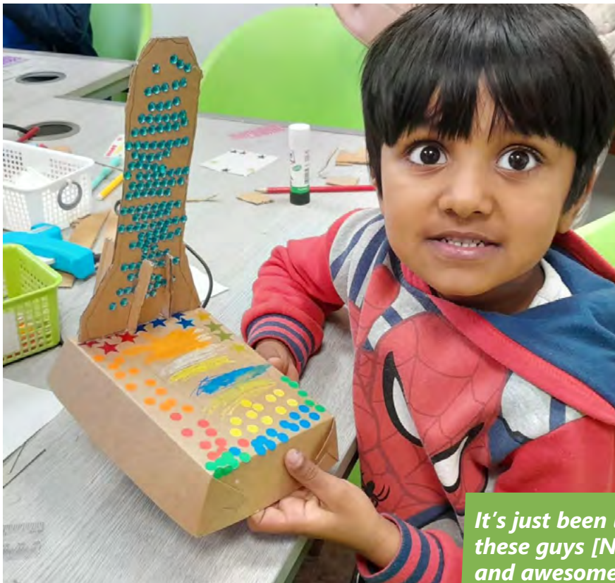
Child enjoys the space activities as part of the after school club

It's just been inspiration to work with these guys [NSC] – they've been reliable and awesome. Reliable is key... they deliver on what they say they are going to deliver, and that's what's so great working with the Space Centre.