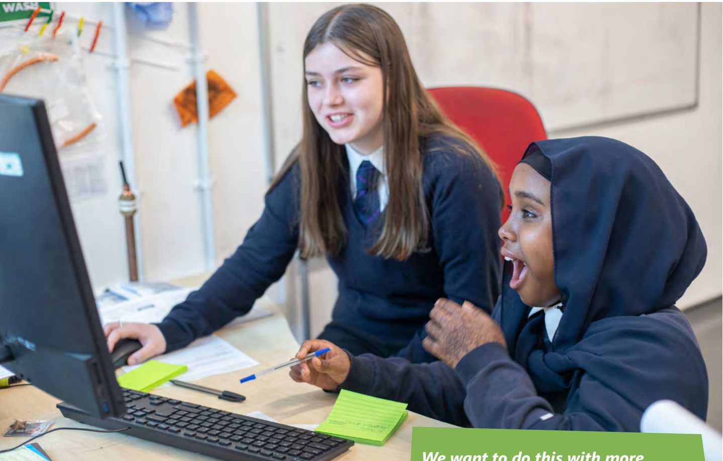
Pupils from City Academy Bristol creating TikTok-style videos to authentically express their views on space science

female astronauts and the gender biases in the design challenges faced by women in the International Space Station. Additionally, some students expressed scepticism about space exploration, believing that resources should be focused on solving problems and exploring Earth. They also discussed inequalities within the space industry and criticized the privileged position of billionaires in space travel.