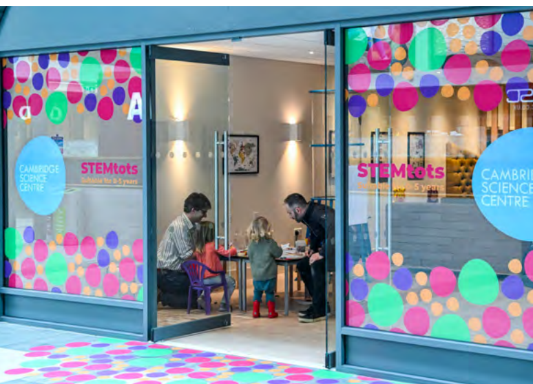
The STEMtots pop up hub in Grafton Shopping Centre, Cambridge

CSC staff noticed shoes came off when visitors felt comfortable and when they planned on staying for a longer visit.