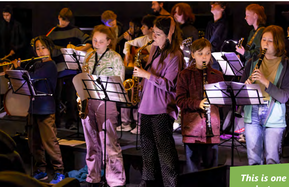
Young people finding their tribe and experiencing the power of music inside the planetarium at Dynamic Earth

filmed by the Schmitt Ocean Institute. The two pieces have been recorded and permanently incorporated into the planetarium shows and, alongside a performance of 'Sunscares' for friends and family, a recording has been made for a tour around Scotland with Dynamic Earth's portable planetarium.