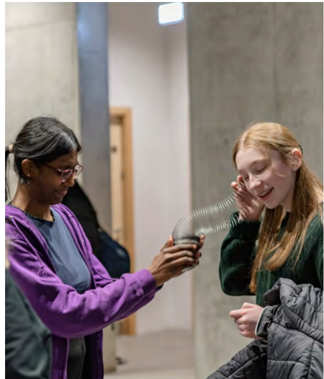
An all-female visit to Jodrell Bank for 'Girls Night Out', inspiring the next generation of female physicists.