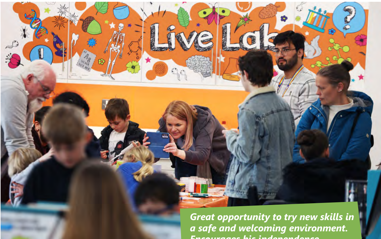
Banbury Community Group families visiting Science Oxford for a STEM activity day

Great opportunity to try new skills in a safe and welcoming environment. Encourages his independence and social experiences. Amazing opportunity as fully funded.