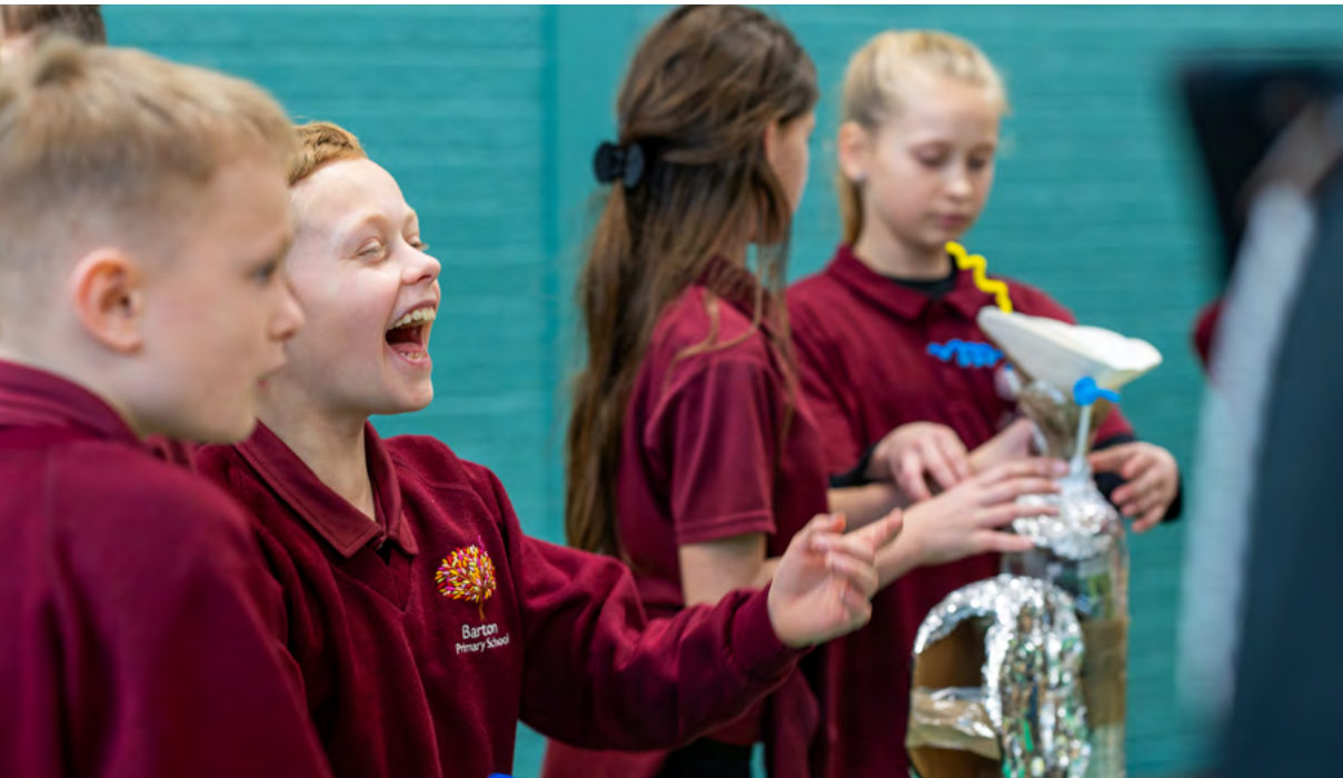
Pupils from Barton Primary School enjoying the experiments during the materials workshop