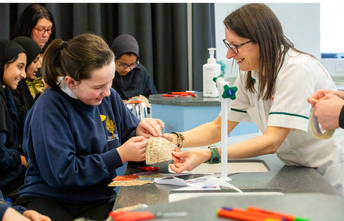
School pupils meeting and interacting with STEM professionals