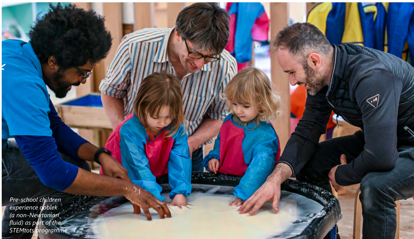
Pre-school children experience ooblek (a non-Newtonian fluid) as part of the STEMtots programme