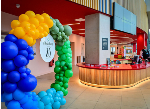
Photos of ASDC25 at the National Science and Media Museum in Bradford: